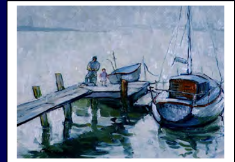
"Lake Ontario" © Albert Chiarandini

149 High St. - Box 1455 Sutton West, Ont. L0E 1R0 905-722-9587 info@gacag.com www.gacag.com